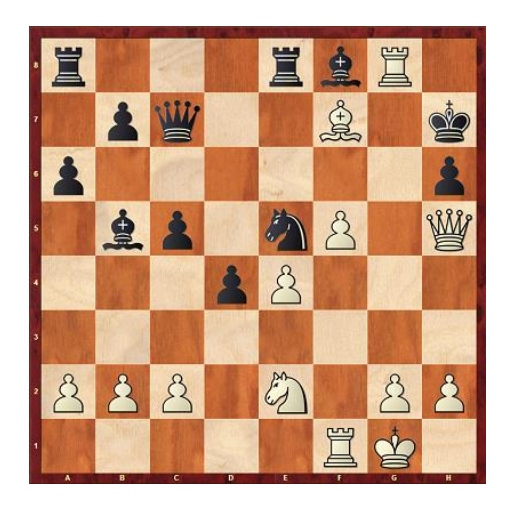
White to play

In April Fun Zone we prepared 4 easy Mate-in-two combinations. Enjoy and test your speed!